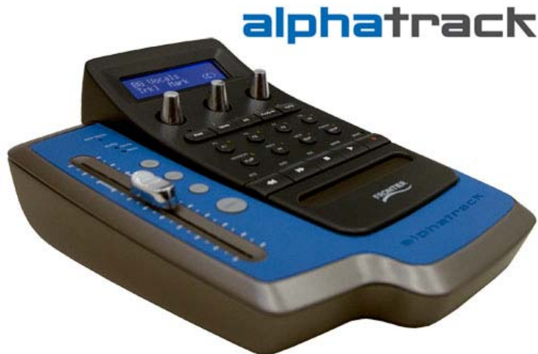
Fig. 1: AlphaTrack Unit

This document describes how to gain access to the AlphaTrack’s controls and display elements using Native mode MIDI messages. It is useful to software developer’s, but most users do not need to refer to it. The Frontier Design Group’s AlphaTrack provides “channel strip” and global controls for PC- and Mac-based Digital Audio Workstation (DAW) software. The AlphaTrack consists of a compact unit that plugs into a USB port of either a Mac- or Windows-based PC. For DAW software packages that allow for the creation of custom control surface plug-ins, the driver provides what we refer to as “Native” mode. For other DAW software packages, the AlphaTrack USB driver provides HUI emulation. The AlphaTrack driver applet allows the user to select which mode (Native or HUI emulation) the driver operates in. AlphaTrack presents itself as a MIDI input/output device, and the driver converts all inputs (buttons, encoder, and fader) and all outputs (LED’s and LCD) on the unit to common MIDI messages.