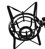
PSM1 shock mount (optional)