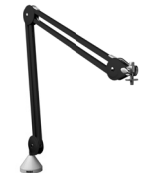
PSA1 studio arm (optional)