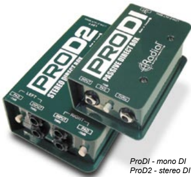
ProDI - mono DI ProD2 - stereo DI

Following the footsteps of the Radial JDI, the ProDI is a high-quality ultra-compact passive direct box that has been specifically developed to allow regional sound companies and project studios to enjoy the quality of a Radial direct box at a more affordable price point.