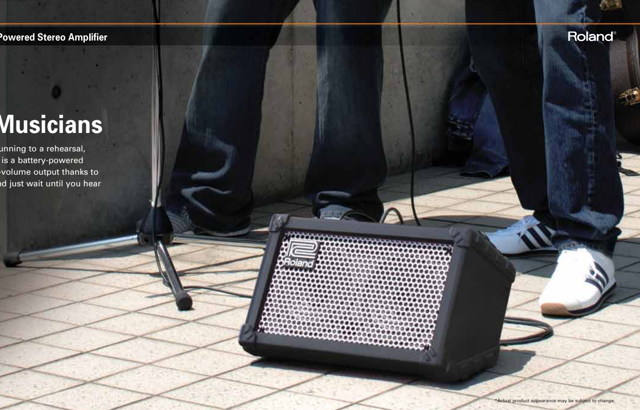
*Actual product appearance may be subject to change.