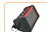
CB-CS1 Gig Bag for CUBE Street